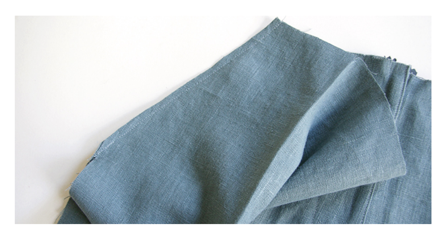
6. Trim the seam, turn right side out and press flat. Topstitch 1/4" (6 mm) from the folded edge.