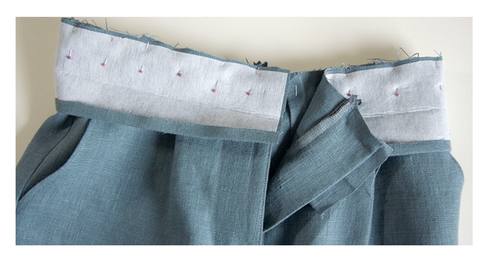
16. Sew at a 3/8" seam allowance. Trim the seam to 1/4" and press waistband up.