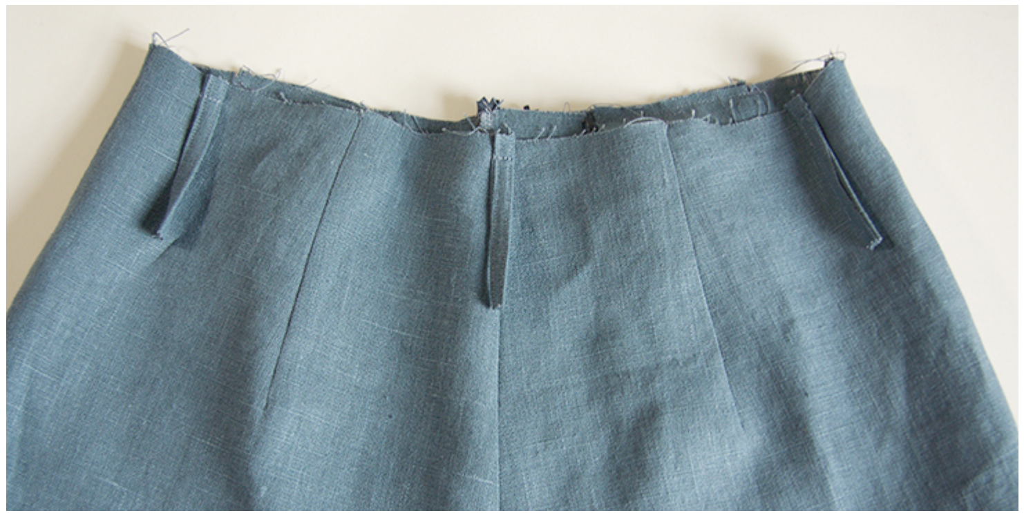
14. Apply fusible interfacing to the wrong side of your waistband. Then fold in half lengthwise wrong sides touching and press one long seam allowance 3/8" to the wrong side.