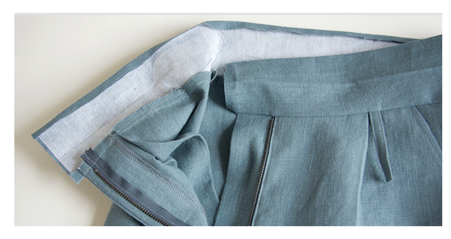
17. Tuck in the short edges of the waistband. Fold the waistband in half and